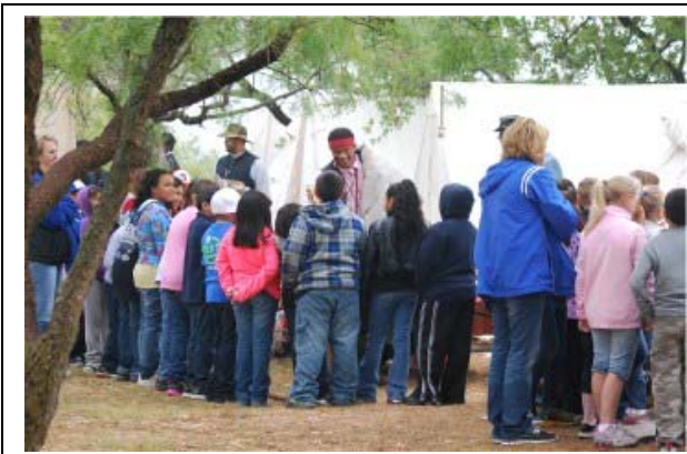
Texas Buffalo Soldiers and students on Friday