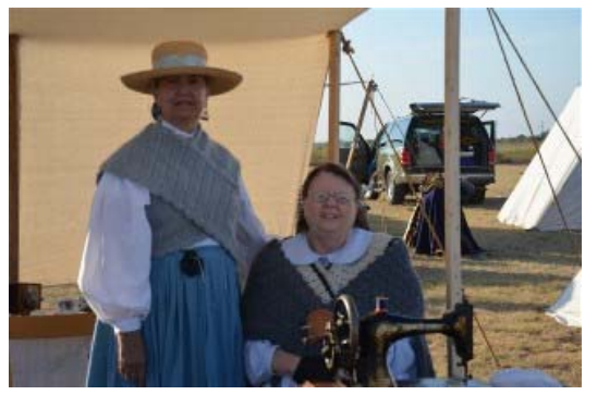
Fort McKavett Frontier Ladies showing their wares