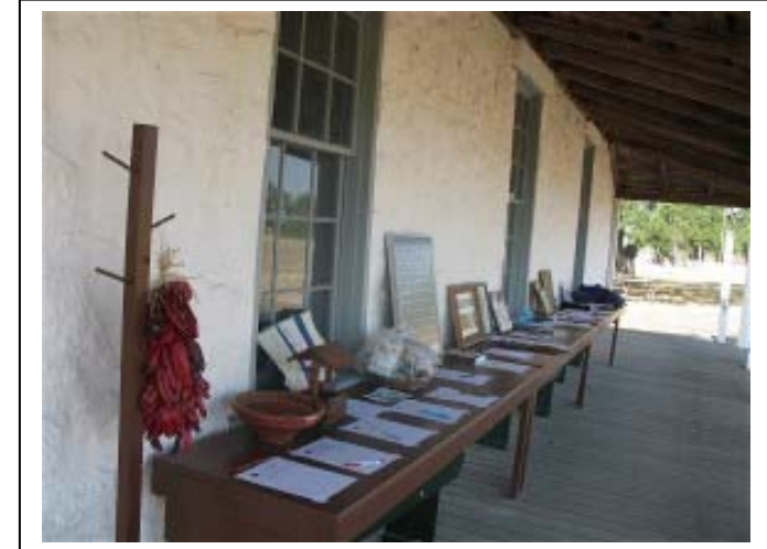
We cleared with donations and the silent auction, appx $900 that can be used to help pay for the fort's West Texas heritage days

We had 2.5" of rain on Thursday night. On Saturday we had a very successful silent auction and a nice brisket dinner furnished by the Friends of Fort McKavett. The astronomers pitched in and helped prepare the meal and helped serve. Saturday night was clear and according to the staff, we had 33 visitors come look through our scopes.