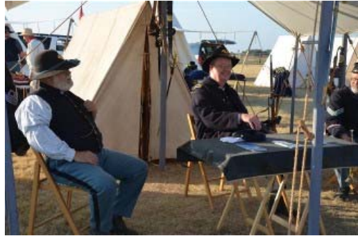
Fort McKavett Recruiting Station with NCO and Officer ready to sign up new troops