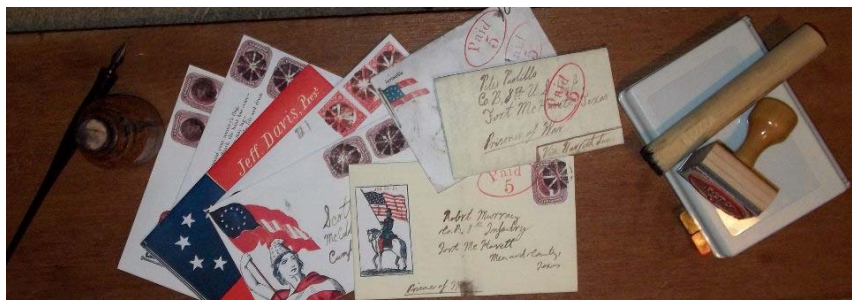
Part of the letters and post office equipment for the event