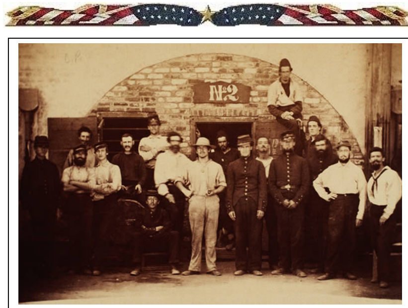
Union Prisoners During the Civil War

Some other historical sites that will also be available for touring or viewing are the Menardville Museum, Fort McKavett, Mission Santa Cruz de San Sabá (site only), Mission Theater, Ditch Walk, and the historical churches around Menard. For more information, call 325-396-2365 or 325-396-2424.