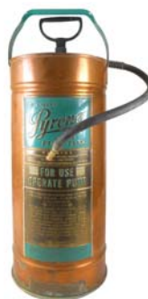
Left: The type of pump fire extinguisher sent to Fort McKavett in 1870. Fort McKavett was sent two of these according to Quartermaster records.