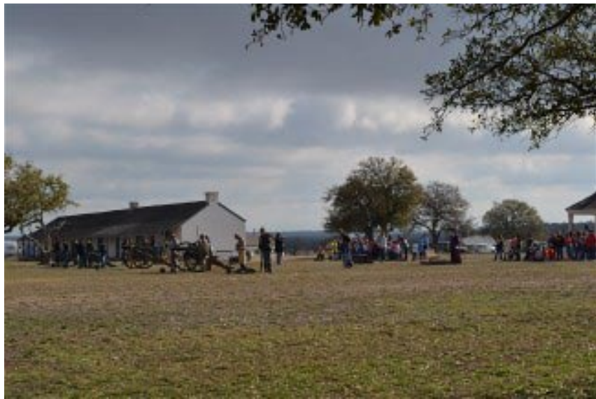
Artillery Line Ready to Fire...