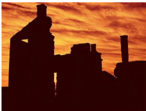
Left: Sunrise at the Commanding Officers Quarters, Bottom Left: Camel Rides Bottom: Saturday Morning Breakfast