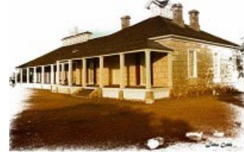
Fort McKavett State Historic Site

Color Copies of all the Fort McKavett Gazettes can be found at: