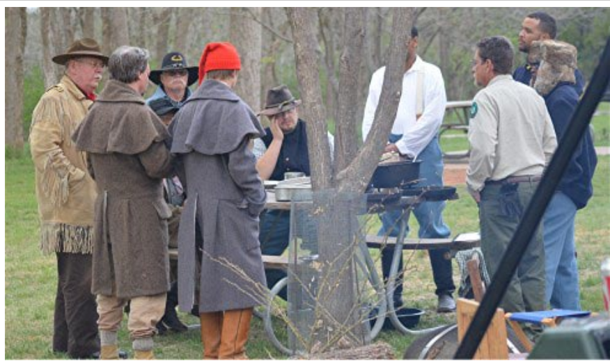
Safety Meeting at Copper Breaks