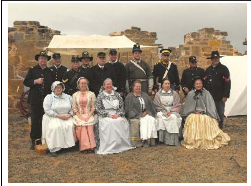
Fort McKavett Volunteers at Fort Chadbourne's Living History Event in May.