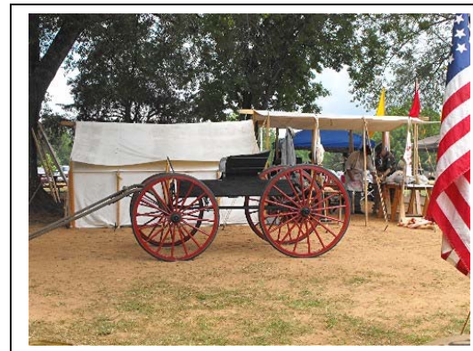
Left: The Doctor's Buggy exhibit from Fort McKavett was a big hit. It rained off and on during the event, but the turnout was great.