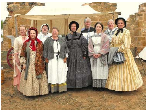
Upper Left: Ladies at Fort Chadbourne. There were several exhibits including Laundress and Wives displays.