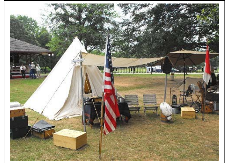
Fort McKavett's Display at the Texas State Railroad in Palestine, Texas in May, 2009