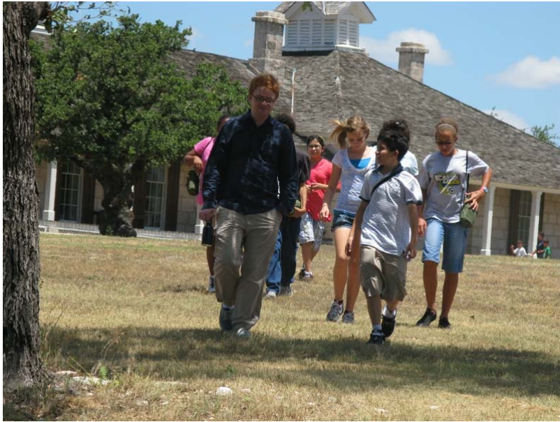
Campers preparing to leave Fort McKavett in June

The fourth year of the Old Stories, New Voices summer camp started with campers loading up at Fort McKavett before leaving for the Prude ranch near Fort Davis. They then spent the night in Santa Fe, NM before heading for Gloretha Pass and the other Civil War sites. They will end up at Gettysburg for the 4 th of July weekend reenactment before heading home!