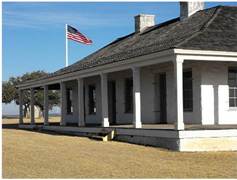
Fort McKavett's Headquarters Building

The headquarters-building at the post is a stone structure, 50 by 42 feet, by 10 feet high to the eaves from the floor, which is raised a little over 2 feet from the ground, situated on the eastern side of the main parade-ground. A veranda extends along the front and sides. This building contains six rooms, of nearly equal size, viz, the commanding officer's office, adjutant's office, sergeant major's and clerk's office, the post school-room, the court-martial room, and the post library the latter used at night for school for the enlisted men.