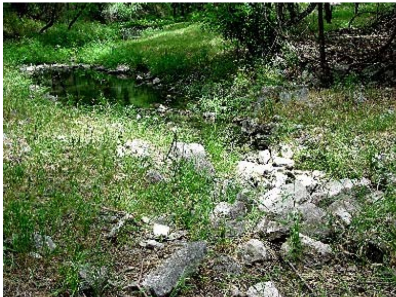
Government Springs at Fort McKavett showing all the springs are flowing. This is a “must see” for visitors to the site. It is the turn around point on our nature walk at the Post.