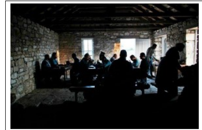
The Bakery was used as the Mess Hall for the folks attending this year's event. There was a good turnout of people for this year's event and plans are already being made for next year