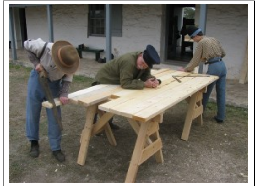
Participants got to make several beds for the barracks during their weekend