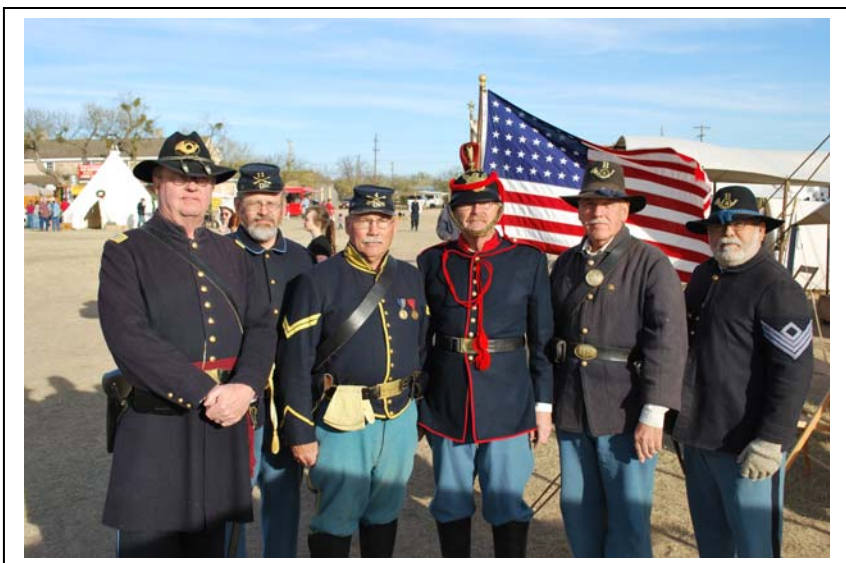
Fort McKavett volunteers at this year's Christmas at Fort Concho.