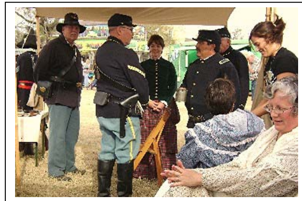
The Gang on Saturday