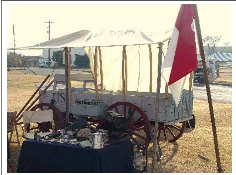
Fort McKavett Wagon at Fort Concho