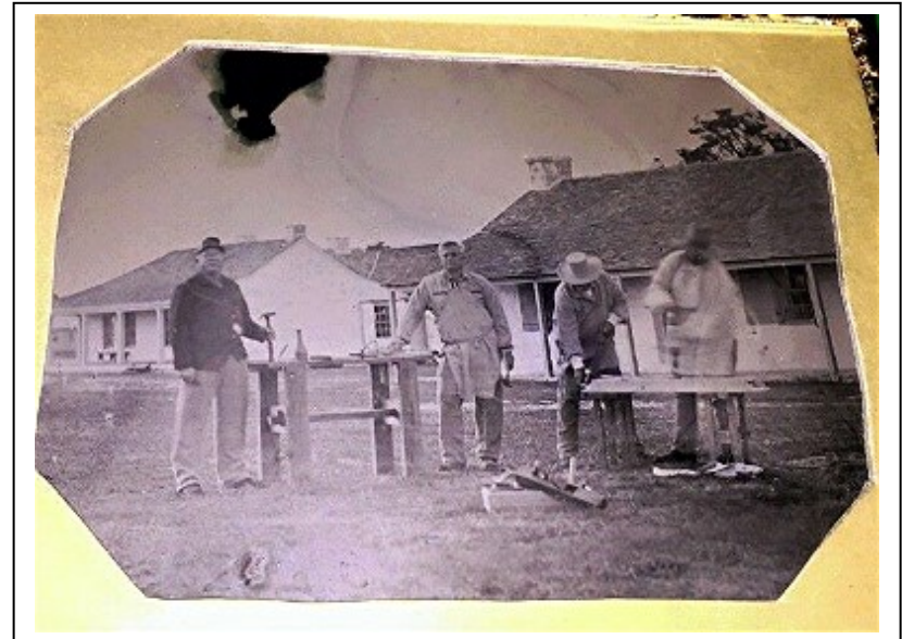
Volunteers and Staff working on displays

Photos to the left show before and after shots of the progress so far.