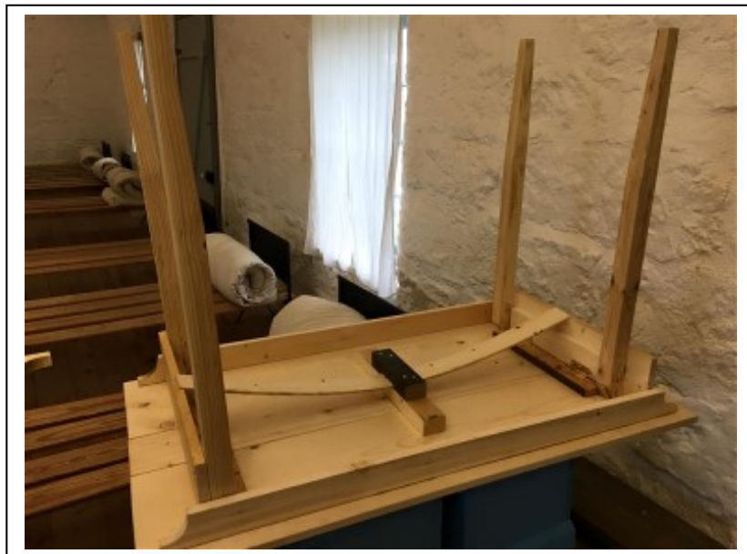
One of the tables the crew made for the Barracks. It is from vintage plans and folds.