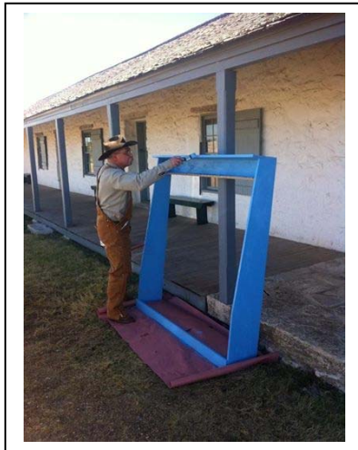
Getting ready for Fort McKavett's Winter, 1852 event which will be occurring December 12-14. Painting and cleaning the barracks furniture.

Winter, 1852 Event This will be a semi-immersion event that showcases "a day in the life of Fort McKavett." Join living historians from all across the U.S. as they go through the daily routine of a frontier post. From the sound of reveille in the morning through tattoo at dusk, the living historians of Co. H, 8th US Infantry will be living the life of a regular stationed at Fort McKavett in December 1852. Drill and fatigue details will be ongoing throughout the day.