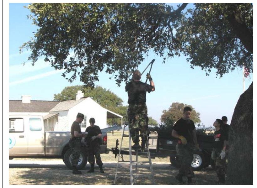
Civil Air Patrol Squadron TX403 from Bell County Temple, TX.

Education Day this year was a grand success! The weather held off and the temperatures were comfortable for the students to see over 15 exhibits and nature hikes to the Government Springs. We had close to 500 kids this year on Friday. Thanks to everyone who gave their time to make this happen!