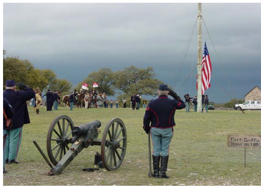
Flag Raising on Saturday Morning at Fort McKavett. Note the dark clouds and rain in the background.

We decided to cut everyone loose on Saturday afternoon early (3:30) when we were told there was more bad weather on the way. Everyone took time in their packing to police up the area before they left.