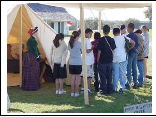
The Frontier Ladies Exhibit at Fort McKavett's encampment during Education Day