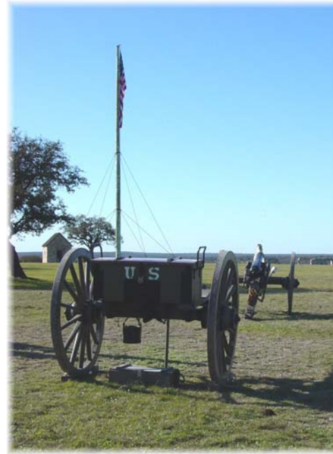
Fort Concho Gun and Limber on the McKavett Parade Ground