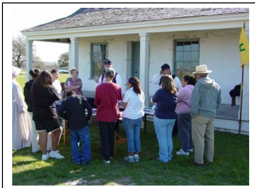
Fort Lancaster's Medical Display with students on Friday